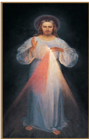
Image of Mercy

In 2002 Holy Father John Paul II said in Błonia Park in Cracow: The hour has come when the message of Divine Mercy is able to fill hearts with hope and to become the spark of a new civilization: the civilization of love.